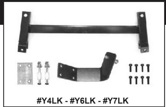
(Diagram A - Rear View)

Raise cart & support frame w/ jack stands. Remove rear body inspection cover. Remove shocks from top mounts. Remove sway bar from bottom mount. Confirm that all wiring & cables are free of binding. Install new "H" bracket to upper shock mounts. Install shocks to "H" bracket. Shock mounts on front of axle bracket mount. Spacer bushings go inside lower shock axle mount bracket. Install new sway bar bracket and 3/8" aluminum spacer plate (see Diagram B) between axle and chassis with longer bolts. Replace fuel line or bend fuel pump bracket on gas models. Inner fender wells may need to be trimmed or tied back for tire clearance on some tire sizes.